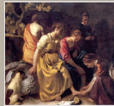
DIANA AND HER COMPANIONS c. 1653–1656 38¼×41¾ in. 98.5×105 cm. Mauritshuis The Hague