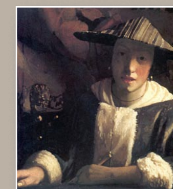
GIRL WITH A FLUTE (Attributed) c. 1665–1670 Oil On Panel 7¾×7 in. 20×17.8 cm. National Gallery Washington D.C.