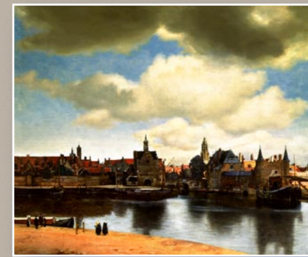
VIEW OF DELFT c. 1660–1661 38¼×46¼ in. 98.5×117.5 cm. The Mauritshuis The Hague