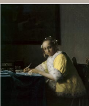
A LADY WRITING c. 1665–1666 17¼×15¼ in. 45×39.9 cm. The National Gallery Washington D.C.