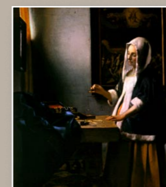
WOMAN HOLDING A BALANCE c. 1622–1665 15¼×14 in. 39.7×35.5 cm. The National Gallery Washington D.C.