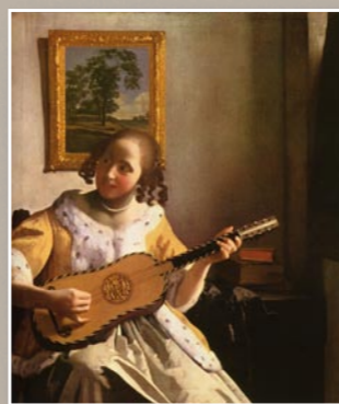
THE GUITAR PLAYER c. 1669–1672 20¼×18¼ in. 53×46.3 cm. Kenwood English Heritage As Trustees Of The Iveagh Bequest