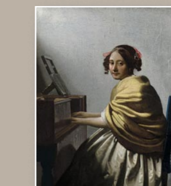
A YOUNG WOMAN SEATED AT THE VIRGINALS (Recently attributed) c.1670 9¾×7¾ in. 25.2×20 cm. Wynn Casino Las Vegas