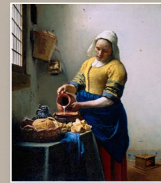
THE MILKMAID c. 1658–1661 17¼×16 in. 45.45×40.6 cm. The Rijksmuseum Amsterdam