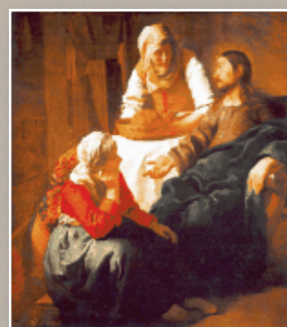
CHRIST IN THE HOUSE OF MARTHA AND MARY c. 1654–1656 63×53¼ in. 160×142 cm. National Gallery Edinburgh