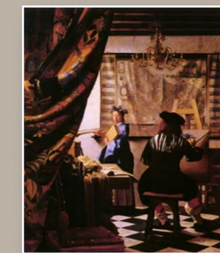
THE ART OF PAINTING c. 1662–1668 47¼×39¾ in. 120×100 cm. Kunsthistorisches Museum Vienna