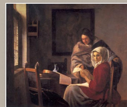
GIRL INTERRUPTED IN HER MUSIC c. 1658–1661 28¾×25¼ in. 73.3×44.4 cm. The Frick Collection New York