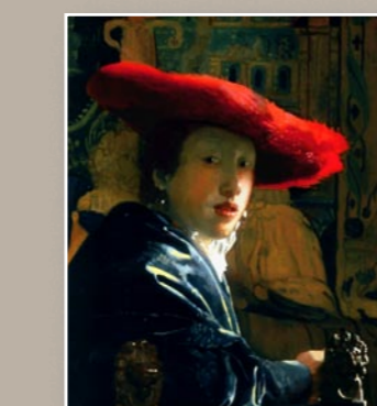
GIRL WITH A RED HAT c. 1665–1666 Oil on panel 9×7¼ in. 22.8×18 cm. The National Gallery Washington D.C.