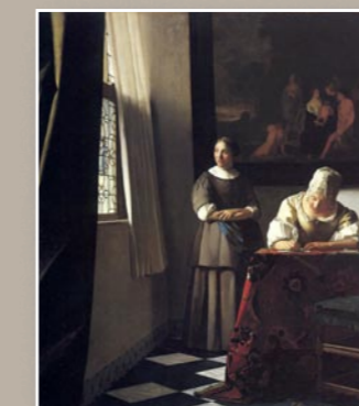
LADY WRITING A LETTER WITH HER MAID c. 1670–1671 28×23 in. 71.1×58.4 cm. National Gallery Dublin