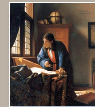
THE GEOGRAPHER c. 1668–1669 20¼×18¼ in. 53×46.6 cm. Städtisches Kunstinstitut Frankfurt Am Main