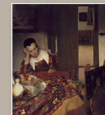
A MAID ASLEEP c. 1656–57 34¼×30¼ in. 87.6×76.5 cm. The Metropolitan New York