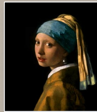
THE GIRL WITH A PEARL EARRING c. 1665–1667 18¼×15¼ in. 46.5×40 cm. Mauritshuis The Hague