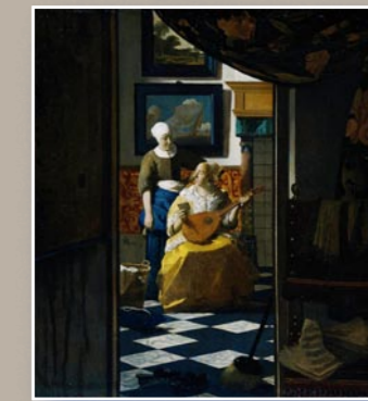
THE LOVE LETTER c. 1667–1670 17¼×15¼ in. 44×38.5 cm. Rijksmuseum Amsterdam