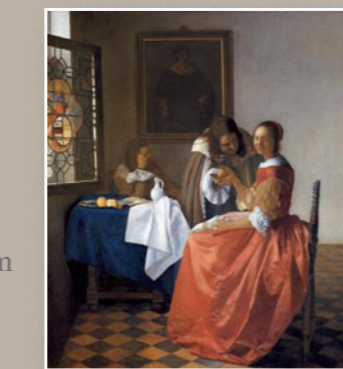
THE GIRL WITH A GLASS OF WINE c. 1659–1660 30¾×26¼ in. 78×67 cm. Herzog Anton Ulrich-museum Brunswick