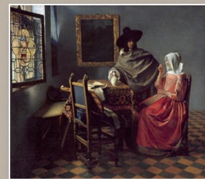
THE GLASS OF WINE c. 1658–1661 25¼×30¼ in. 65×77 cm. Staatliche Museen Preußischer Kulturbesitz, Gemäldegalerie, Berlin