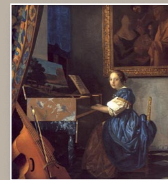
A LADY SEATED AT A VIRGINAL c. 1670 20¾×17¼ in. 51.5×45.5 cm. The National Gallery London