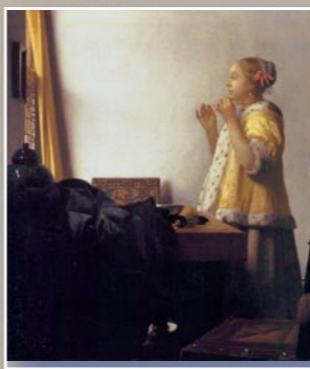
WOMAN WITH A PEARL NECKLACE c. 1662–1665 21¼×17¼ in. 55×45 cm. Staatliche Museen Preusscher Kulturbesitz Berlin