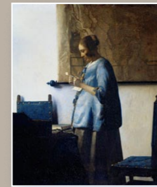
WOMAN IN BLUE READING A LETTER c. 1662–1665 18¼×15¼ in. 46.5×38 cm. The Rijksmuseum Amsterdam