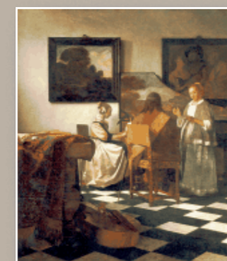
THE CONCERT c. 1664–1667 28½×25 2 in. ??? 72.5×64.7 cm. Isabella Gardner Museum Boston (Stolen)