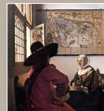
OFFICER AND LAUGHING GIRL c. 1655–1660 19¾×18¼ in. 50.5×46 cm. The Frick Collection New York