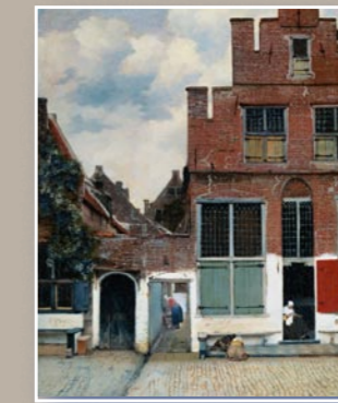
THE LITTLE STREET c. 1657–1661 21¼×17¼ in. 53.5×43.5 cm. The Rijksmuseum Amsterdam