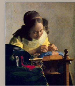
THE LACEMAKER c. 1669–1671 9¼×8¼ in. 24.5×21 cm. The Louvre Paris