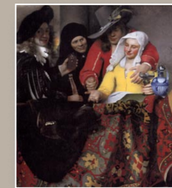
THE PROCURESS 1656 Oil In Canvas 56½×51¼ in. 143×130 cm. Staatliche Kunstsammlungen Dresden