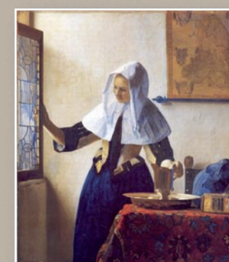
YOUNG WOMAN WITH A WATER PITCHER c. 1662–1665 18×16 in. 45.7×40.6 cm The Metropolitan New York