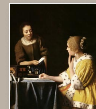
MISTRESS AND MAID c. 1666–1667 35¼×31 in. 90.2×78.7 cm. The Frick Collection New York