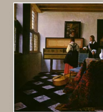
THE MUSIC LESSON c. 1662–1664 28¾×25¼ in. 73.3×64.5 cm. The Royal Collection The Windsor Castle