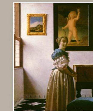
A LADY STANDING AT A VIRGINAL c. 1670–1673 20¾×17¼ in. 51.7×45.2 cm. National Gallery London