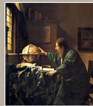
THE ASTRONOMER c. 1668 19¼×17¼ in. 50×45 cm. The Louvre Paris