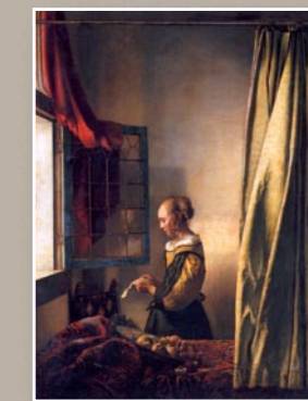
GIRL READING A LETTER BY AN OPEN WINDOW c. 1657–1659 32¼×25¼ in. 83×64.5 cm. Staatliche Kunstsammlungen Dresden